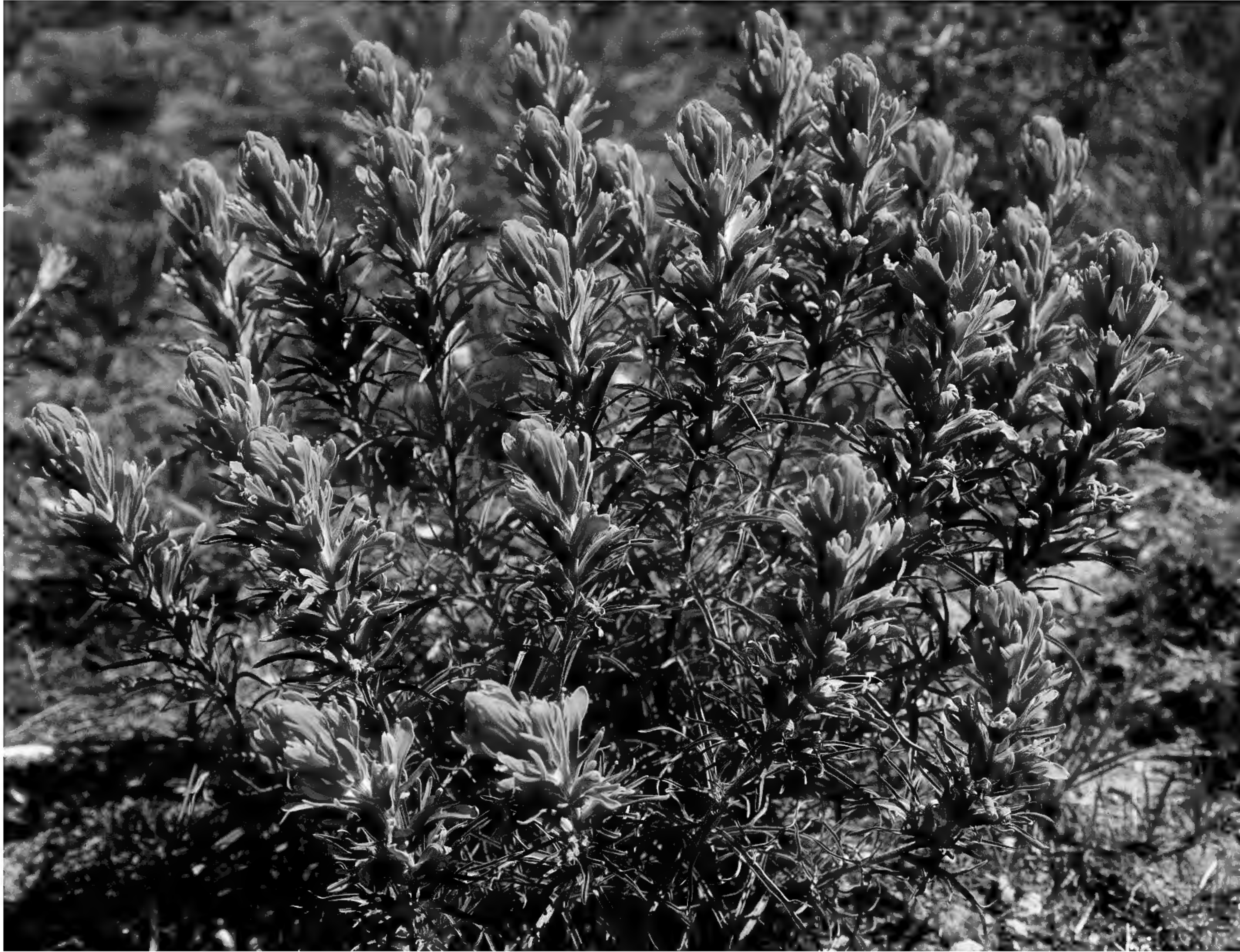
Figure 2. Castilleja purpurea in typical form. Ca. 5 miles east of Santa Anna, along U.S. Hwy 67, Coleman Co., Texas, 20 Apr 1997.